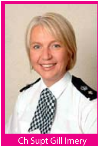
Ch Supt Gill Imery

Easter is traditionally a time when our policing focus changes slightly to incorporate the school holidays, and the challenges they bring. The holidays can signal a rise in certain types of crime, namely vandalism and anti social behaviour. Similarly, the start of British summer time and the lighter evenings means we can